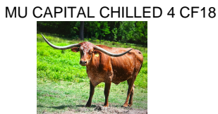
MU CAPITAL CHILLED 4 CF18