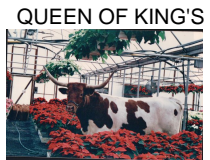
QUEEN OF KING'S