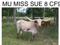
MU MISS SUE 8 CF9